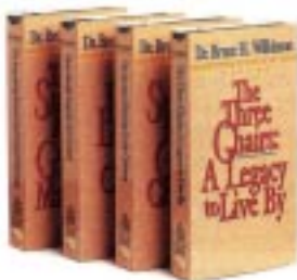
The Three Chairs 4 tape video set: $120/-