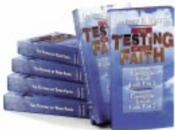
The Testing of your faith 6 tape video set: $180/-

Video facilitation should be accompanied with the respective videos.